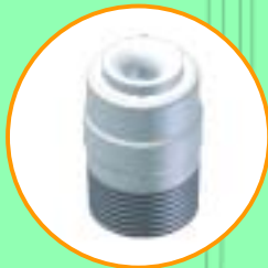
NC Plastic, Full Cone