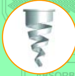
ST Finest Atomization, Full Cone Low Pressure