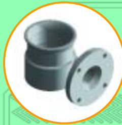
TH Single Hollow Cone