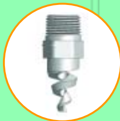
TF Efficient Gas Cooling Full Cone