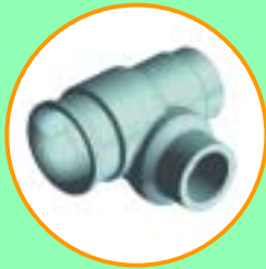
DTH Dual Hollow Cone