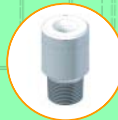
MaxiPass™ Plastic & Alloy, Full Cone Clog Resistant, Maximum Free Passage