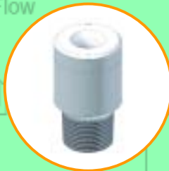
MaxiPass™ Plastic & Alloy, Full Cone Clog Resistant, Maximum Free Passage