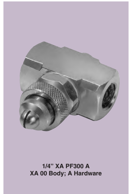
1/4" XA PF300 A XA 00 Body; A Hardware

Dimensions are approximate. Check with BETE for critical dimension applications.