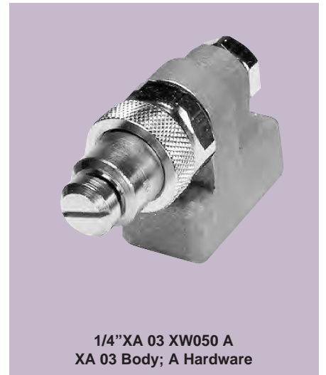
1/4"XA 03 XW050 A XA 03 Body; A Hardware