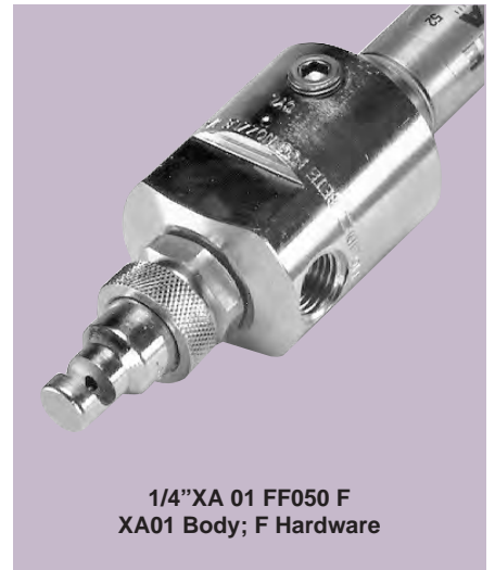
1/4"XA 01 FF050 F XA01 Body; F Hardware