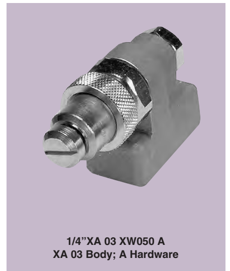
1/4"XA 03 XW050 A XA 03 Body; A Hardware