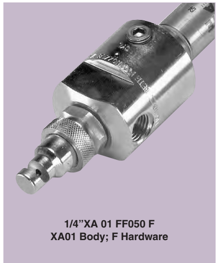
1/4"XA 01 FF050 F XA01 Body; F Hardware