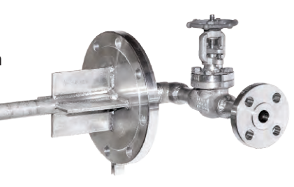
WTZ Lance with Inlet Valve and Gussets

Fabrications are BETE's specialty, from complex Code compliant fabrications to simple pipe and flange assemblies. By using BETE as a single source supplier, you can concentrate on your larger process details, knowing that our experience is working for you.