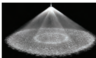
Full Cone 120° (W)