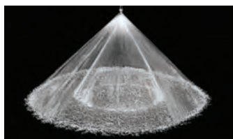
Full Cone 90°

Use of blow-off covers requires a pressure of 25 PSI or higher