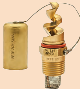
Nozzle with optional protective cover

Use of blow-off covers requires a pressure of 25 PSI or higher