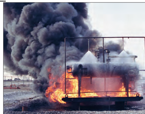
N6 nozzles protect a propane storage tank from fire and explosion.