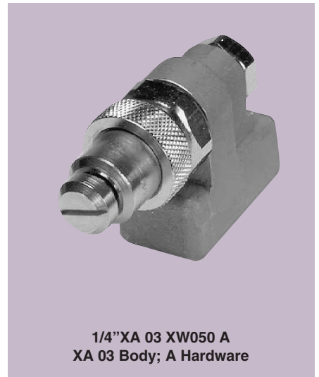
1/4" XA 03 XW050 A XA 03 Body; A Hardware