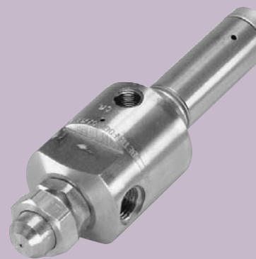
1/4" XA 02 PR050 E XA 02 Body; E Hardware

Dimensions are approximate. Check with BETE for critical dimension applications.