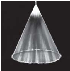
Hollow Cone 50° (N)