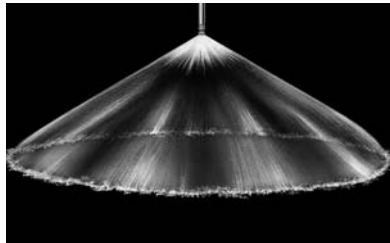
Hollow Cone 120° (W)