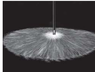
Hollow Cone 180° (XW)